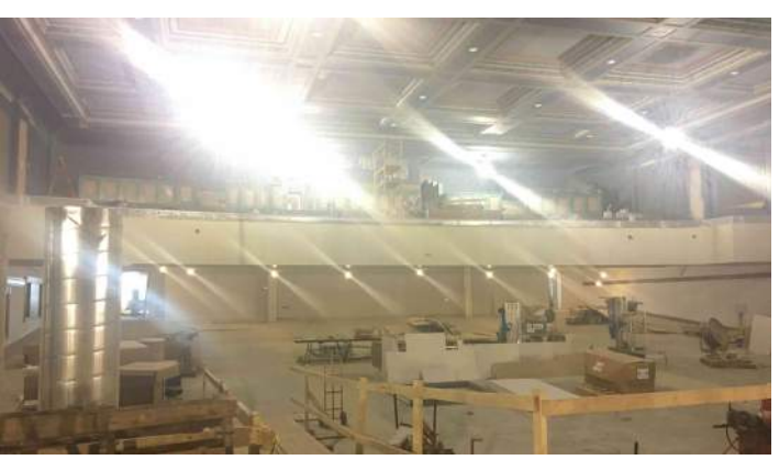
Drywall Installation & Plaster Repair in Auditorium