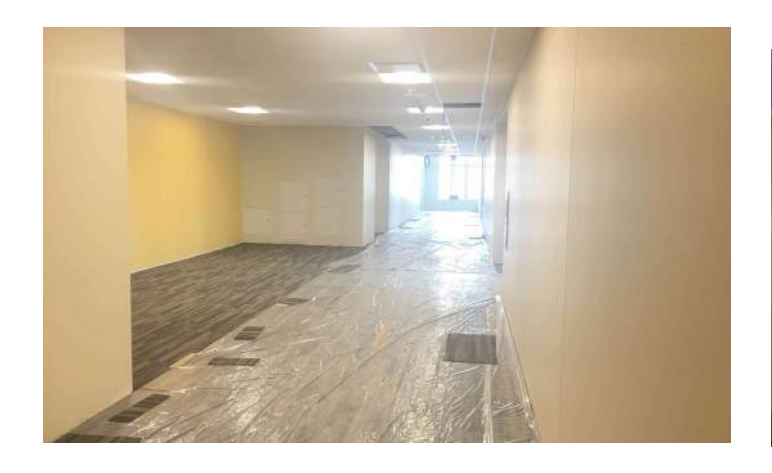
Carpet Installation in 2nd Floor Area A Corridor