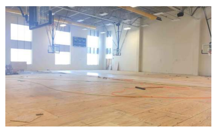
Wood Flooring Installation in Auxiliary Gym