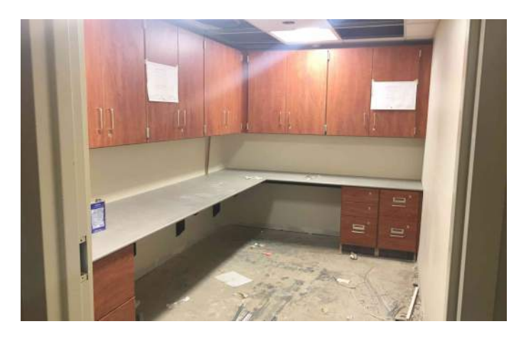
Casework Installation on 4th Floor Area G