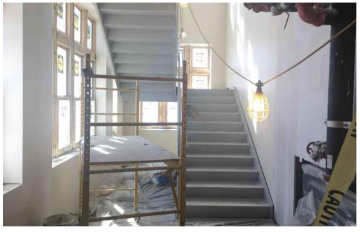
Metal Stair Painting Area F South Stair