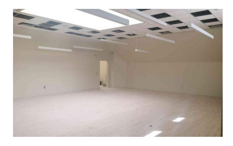
Wood Flooring Installation on 4th Floor Area G